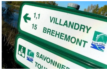
The Loire Valley cycle-path

What makes the Loire so famous. Today's tour takes you through hunting forest, tree covered river valleys and small hamlets to the ancient town of Langeais with its impressive 11 th Century fortress guarding the crossing of the river Loire.